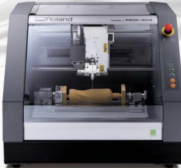
Photo: MDX-40A and optionally available ZCL-40A rotary axis unit

The Roland MDX-40A 3D milling machine is an affordable, easy-to-use prototyping solution that supports a wide range of materials including resin. A new optional rotary axis unit is available, supporting larger materials.